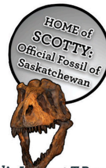
World's Largest T.Rex