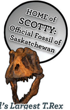
World's Largest T.Rex