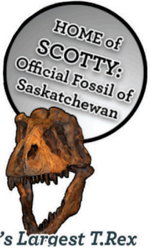
World's Largest T.Rex

This Week Triways is picking up RECYCLING in the BLUE bins