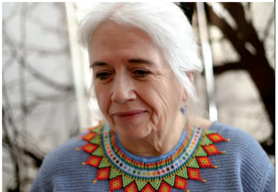
Michelle Good