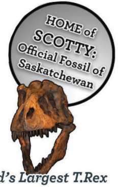
World's Largest T.Rex